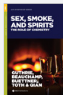
Sex, Smoke, and Spirits: The Role of Chemistry