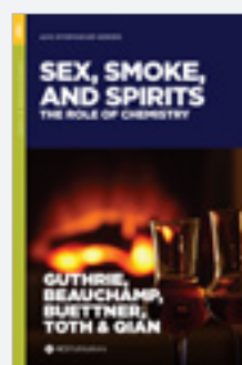
Sex, Smoke, and Spirits: The Role of Chemistry