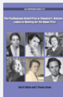
The Posthumous Nobel Prize in Chemistry. Volume 2. Ladies in Waiting for the Nobel Prize